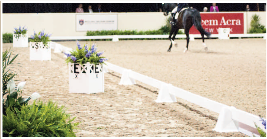
Sundance Arena featured at the 2015 FEI Reem Acra World Cup Dressage Finals™

Storage: Wash sand off rails to prevent scratching. Rails must lie flat on a smooth, flat surface. Cones should be clean and free of sand and debris before stacking.